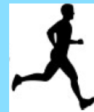
50 minutes of jogging