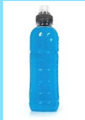
One sports drink (798kJ)

perform everyday functions, as well as being active. What happens when the amount of energy taken in as food is greater than the amount of energy used? - The extra energy will be stored in the body as fat, and it will cause body weight to increase. After playing a sport or participating in some form of physical activity many of us reach for something to eat from the canteen. Many of the foods we eat contain a concentrated amount of energy and we end up leaving energy positive. How do you think you or your kids fare?