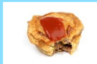
One full fat meat pie (2037kJ)