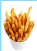
One bucket chips (1255kJ)