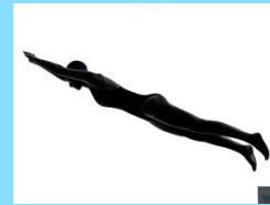
25 minutes of swimming