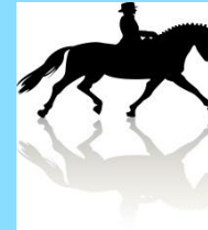
30 minutes of horse riding